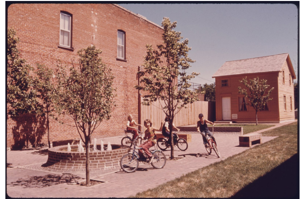
Kids playing in a New Ulm park, circa 1960

Safe Routes to School (SRTS) plans and policies aim to educate the public, make changes to the built environment, and encourage the community to change how they get to and from school or work. Such a focus on bicycle and pedestrian transportation has only increased in recent years. Perceived decreased safety, due to increasing numbers of children getting to school by car, has caused yet more parents and children to use cars – thus perpetuating the downward trend in active transportation.